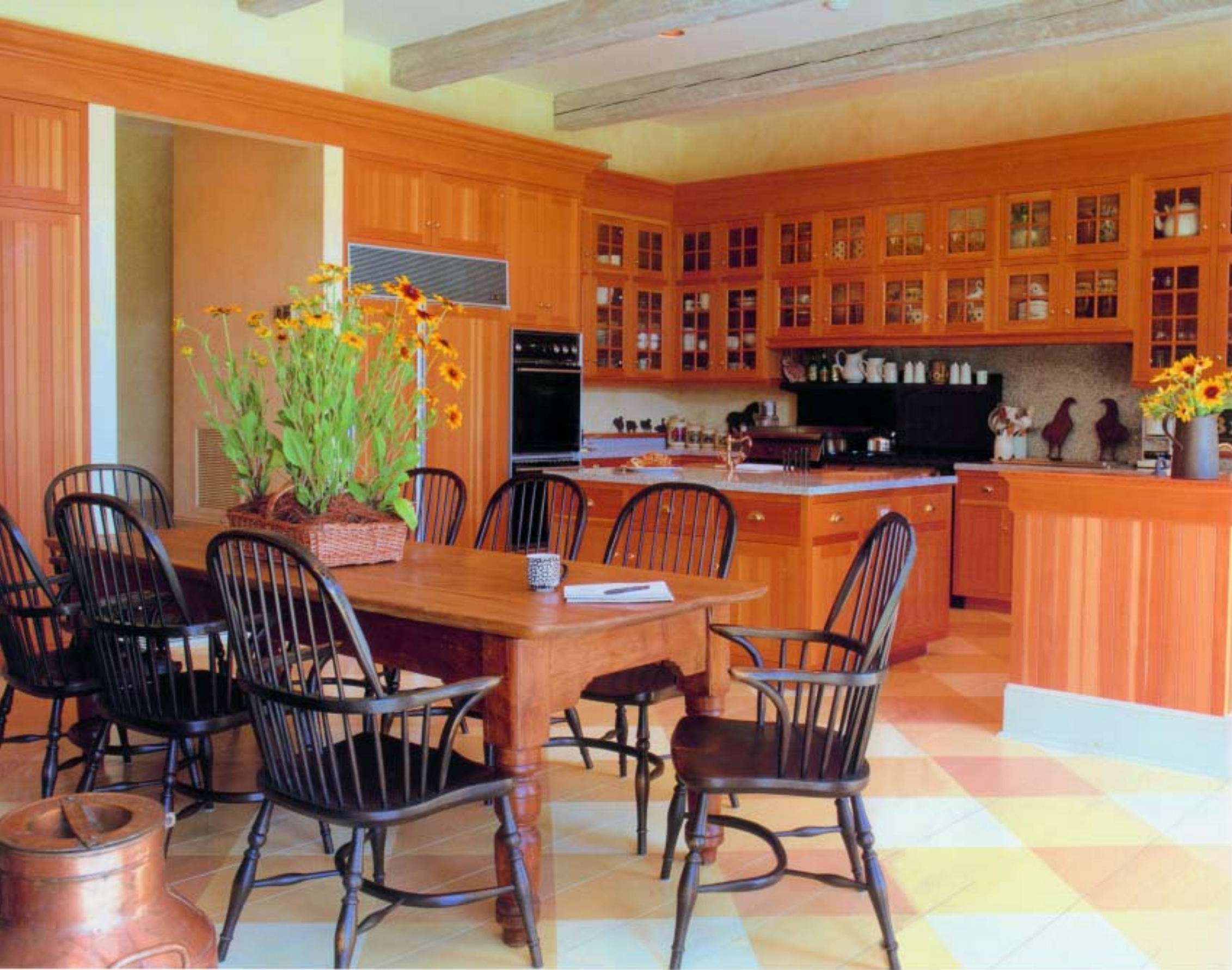
ABOVE The black of the Windsor chairs around the kitchen table echoes the color of the Wolf stove beyond the granite-topped island.