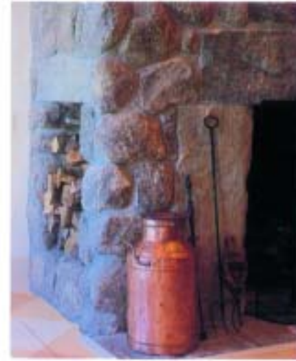
ABOVE Firewood is dried and stored in the side opening of the massive stone fireplace.